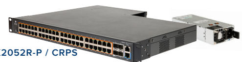
EX2052R-P / CRPS